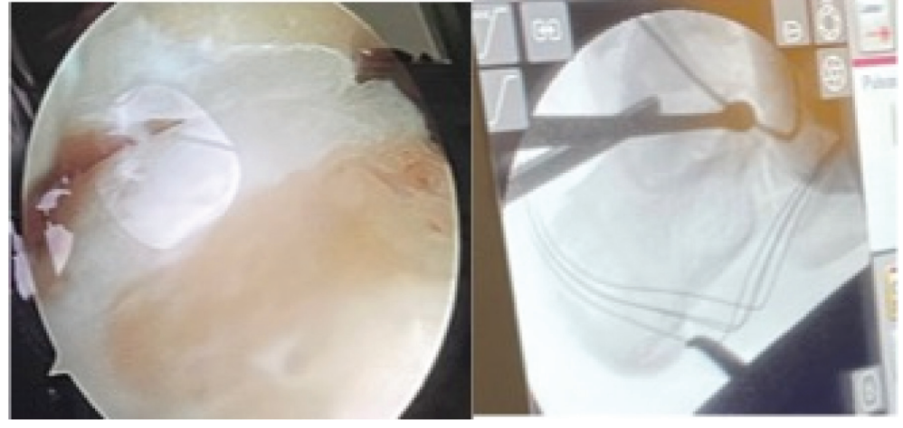
Intra-operative arthroscopic and radiographic images from subtalar coalition resection.