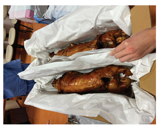
On the last day in the hospital, the fellows enjoyed a lunch of traditional suckling pig.