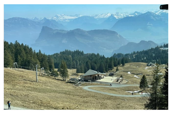
View from the gondola while ascending Mt. Pilatus in Lucerne, Switzerland.