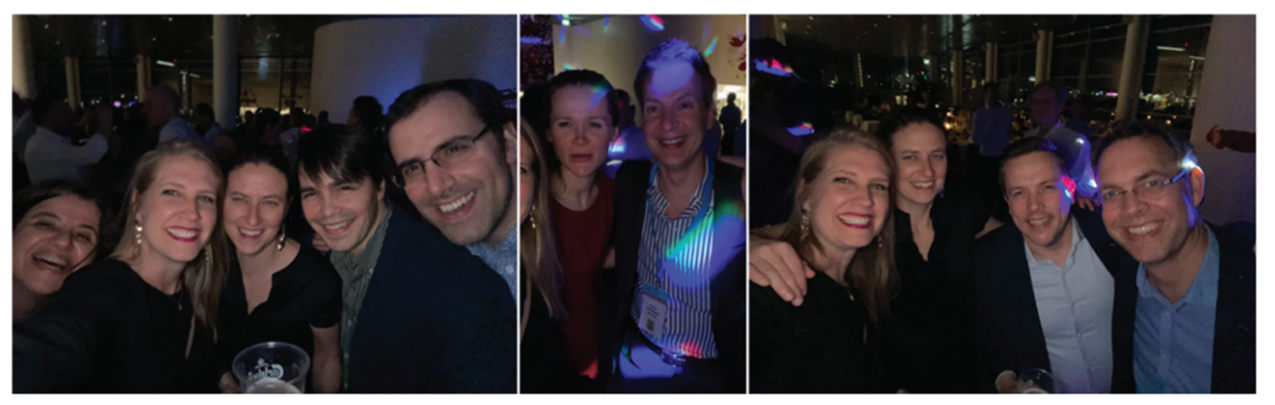
The EPOS final reception with new EPOS colleagues and friends from Portugal (left), Denmark (center), and Switzerland (right).

the work our colleagues have done to advance gender equity in the field. We were also honored to share an exceptional dinner as guests of the POSNA presidential line, and we were excitedly impressed at the 100% dance floor participation rate at the EPOS closing dinner ceremony.