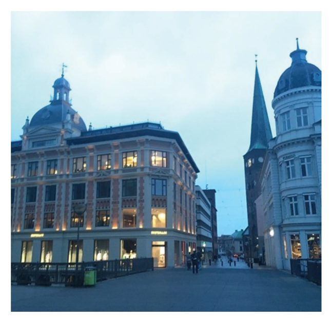
Aarhus City Latin quarter.