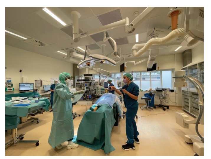
A look inside an Aarhus OR.

These are made in-house and we regretfully did not take any scrub stowaways with us in hopes we will be invited back; however, we recommend them as prototypes to those looking to get into the business.