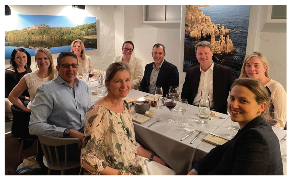
The POSNA presidential line hosted the fellows for dinner.

We spent the end of our trip at the EPOS Annual Meeting, gaining different perspectives on common and rare pathologies. As the first all-female traveling fellows, we were flattered to speak at the Women in Orthopaedics Worldwide (WOW) section, and we were inspired by