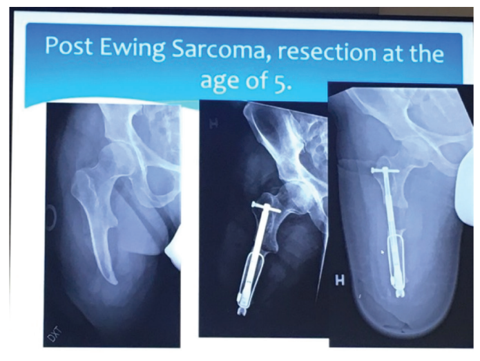
Example of a limb reconstruction patient.