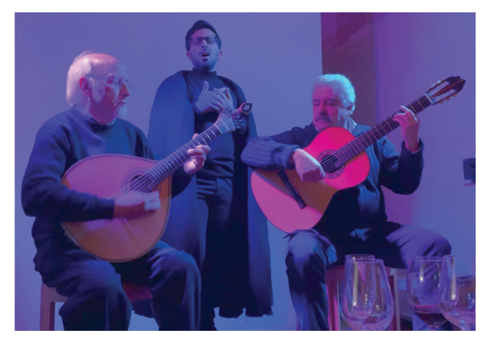
The fellows experienced a special dinner performance of traditional Coimbra Fado music.

Our hosts were devoted tour guides. We explored the campus of the University of Coimbra. It was established in 1537 and is a UNESCO World Heritage Site. We also learned of their traditional dress of capes and ties with colors specific to each faculty that later inspired the themes for Harry Potter.