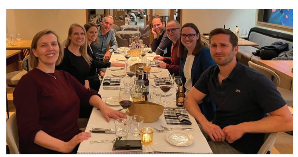
Dinner at Restaurant Bohemia.