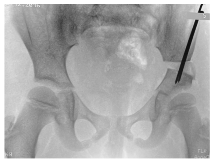
Intra-operative x-ray from left Salter Osteotomy.

x-ray setup and approach provided us with tips to adopt at home.