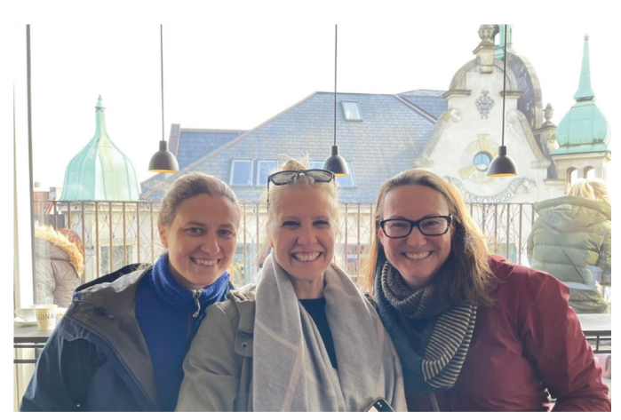
The fellows part ways in Copenhagen.

to apply for their respective traveling fellowships. From our trip, we expanded our pediatric orthopaedic family and perspectives while shrinking our world.