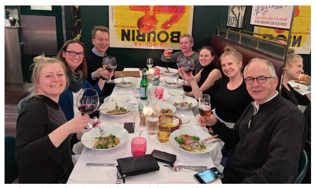
Traditional (fine-dining) Danish dinner with fellows and faculty.